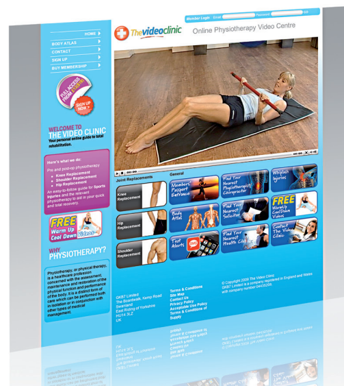
THE NEW FACE OF PHYSIOTHERAPY: Above, The Video Clinic homepage, and pictured right, Exercise Tracking, designed to enable users to chart their exercise progress.

The Video Clinic provides easy-to-follow exercises online, developed by recognised physiotherapists and approved by top sports physicians